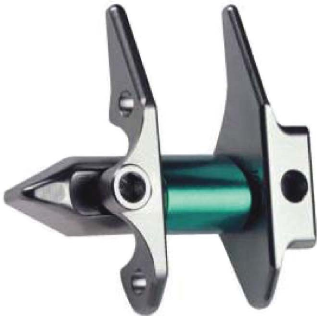
FIGURE 1. The X-STOP device is FDA approved and available in both titanium and PEEK forms.